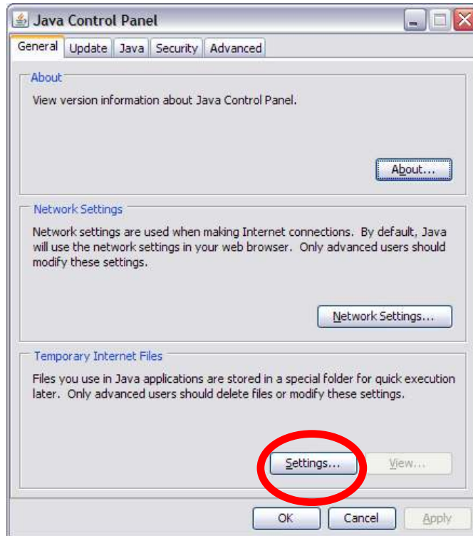
Figure 2 – Java Control Panel

Once the Java Control Panel is open then select the “Settings” button in the “Temporary Internet Files” section (Figure 2).